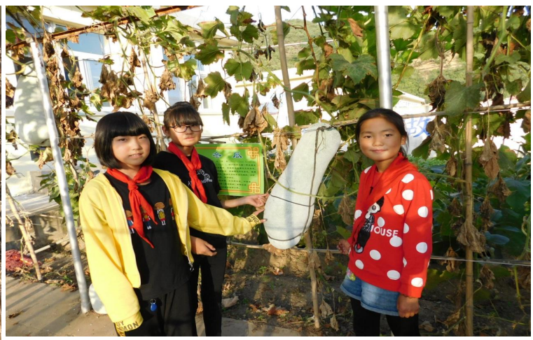
Left: Students from Liubozizixiaoxue School in the fields. Right: Crop yields from Toudaogou Xiaoxue School.