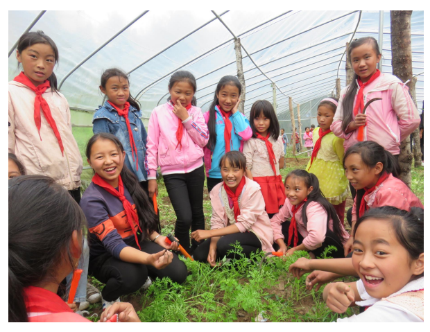
The joy of a bountiful harvest in the school's fields

For many years, Zigen has been committed to promoting education for sustainable development in rural areas. We sincerely invite you to join us in witnessing the practices and achievements of Zigen's rural Green Eco Schools, engage in face-to-face discussions with teachers and students, and get closer to the real educational environment in rural schools. We also look forward to discussing with you how we can work together to enhance rural education and rural