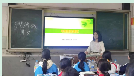
罗甸县罗悃中学开展《与情绪做朋友》课程 Luodian County's Luokun Middle School conducted the course "Making Friends with Emotions."