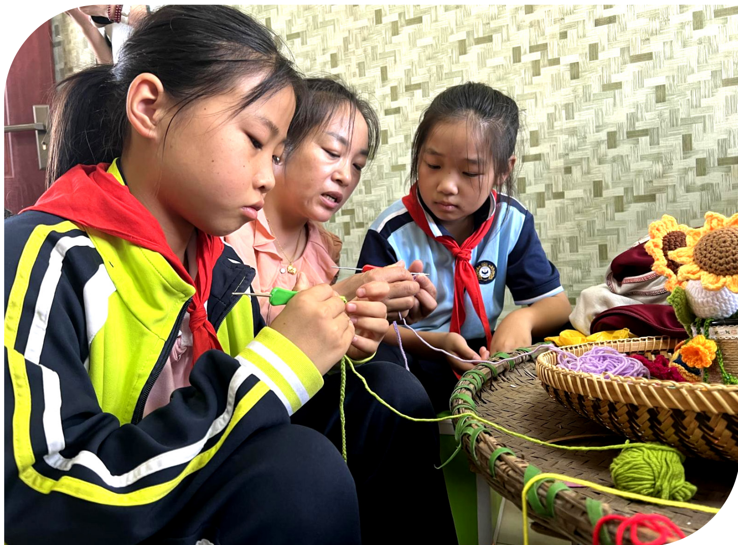
湖北省武汉市新洲区徐沟小学的乡土文化学习编织课程 The Local Culture Weaving Course at Xugou Primary School, Xinzhou District, Wuhan, Hubei Province

Donate by Credit card: www.zigenfund.org/donate