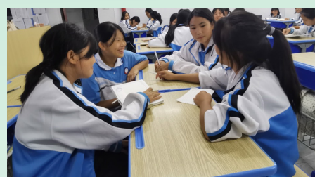
罗甸二中青春期健康教育课堂 Luodian No. 2 Middle School held adolescent sex health education classes.